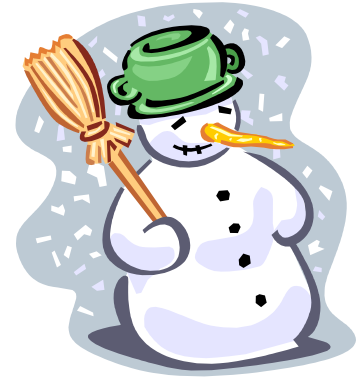
Snowy days ahead!