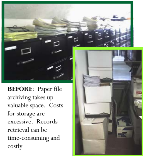
BEFORE: Paper file archiving takes up valuable space. Costs for storage are excessive. Records retrieval can be time-consuming and costly

With Digital Imaging Services, we offer custom indexing and document set-up to meet your needs so that files are stored safely and can be easily retrieved. We also offer a shredding service to dispose of the paper files once they are safely scanned to the CD or DVD.